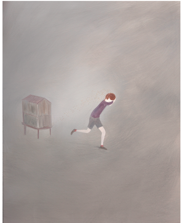
"Bees" acrylic on linen, 90x72cm, 2012

For further information and images, please inquire by phone or e-mail.